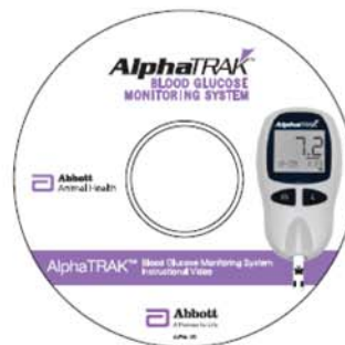
7. AlphaTRAK Instructional Video (Color and language may vary).