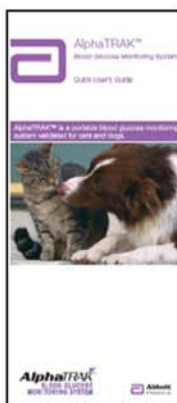
5. AlphaTRAK Quick User's Guide