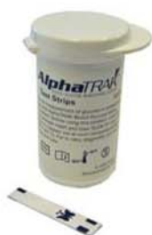
2. AlphaTRAK Strips (Vial of 50 Strips)