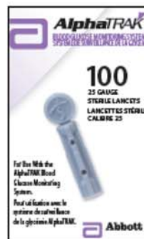
4. AlphaTRAK Lancets (100 lancets per box)