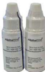
3. AlphaTRAK Control Solution (2 per box)