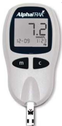
1. AlphaTRAK Meter

Finally a Take-Home Kit that provides * Accurate and Meaningful Results * to assist with your Management of Diabetic Dogs and Cats